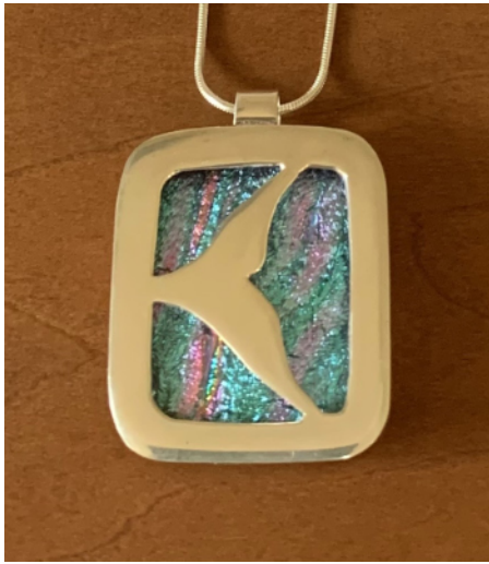
I showed a piece I created some 0me ago using sterling over a dichroic glass cab I made.