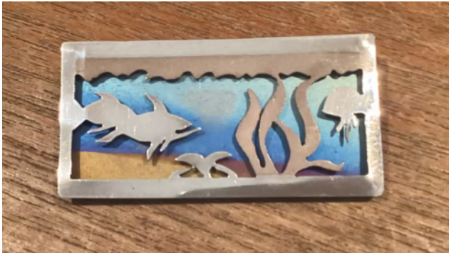
Marianne created an ocean brooch in the past; the background is @anium.