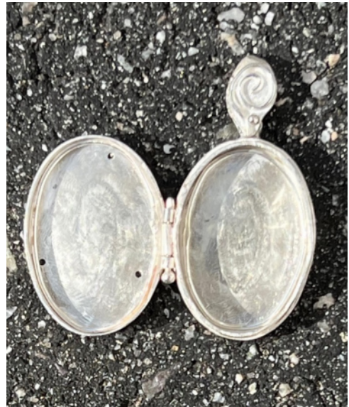
Cynthia showed us a locket she made.