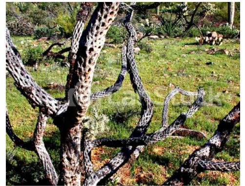
And I gave a much less verdant presentation on cholla cactus, one of the mystery elements for our Ocean Meets Desert Challenge. (It's currently 109 here in Tucson. Send pics of greenery—and water!)