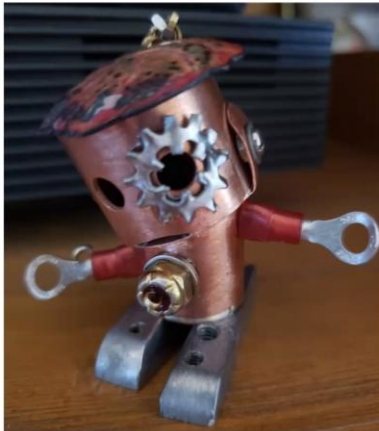
Upcycled pieces and parts from my dad with added enamel nail