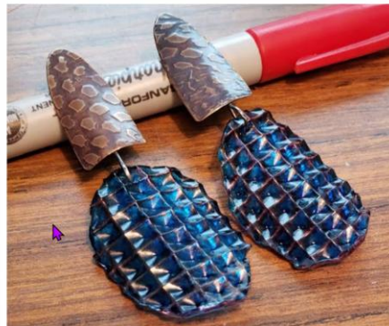
Plastic fluorescent light diffuser with alcohol ink and red sharpie marker highlights